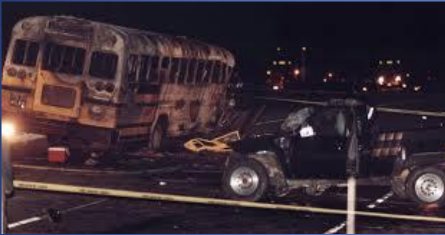
May 14, 1988 Carroll County bus crash 24 children & 3 adults were killed by a drunk driver.