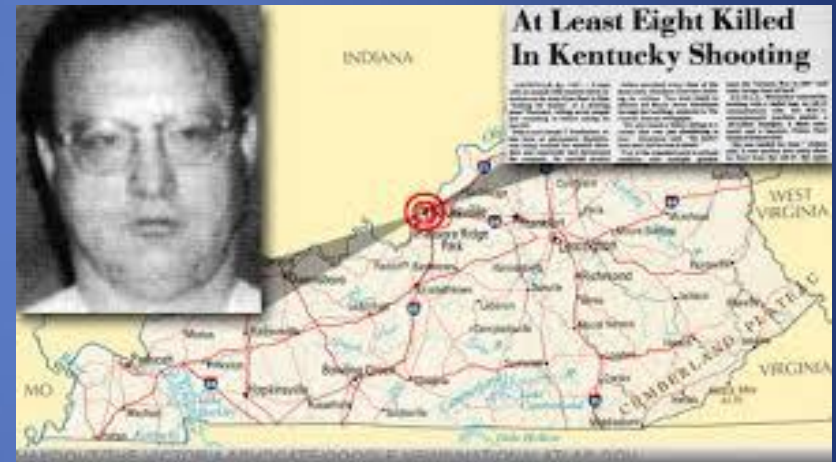
September 14, 1989 Standard Gravure Westbecker kills 8 co-workers and wounds 12