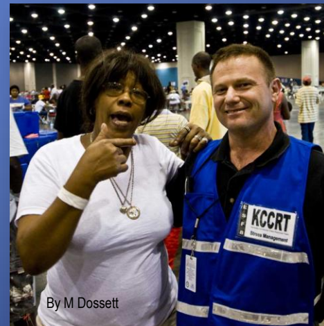
By M Dossett